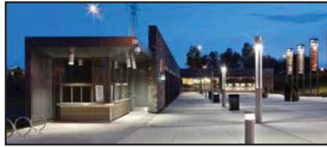
Calgary Zoo North Gate Pavilion, courtesy Cohos Evamy. Photo: Tom Arban.

An entry for the Royal Canadian Pacific Entry Pavilion - recognized