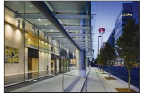
Bankers Court Office Tower, courtesy Cohos Evamy. Photo: Tom Arban.

are eligible for nomination to the national Royal Architectural Institute of Canada Urban Design Awards, planned to take place in 2010. ❖